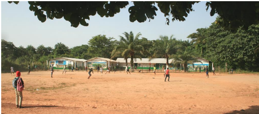
The school in Cacine with the footballground