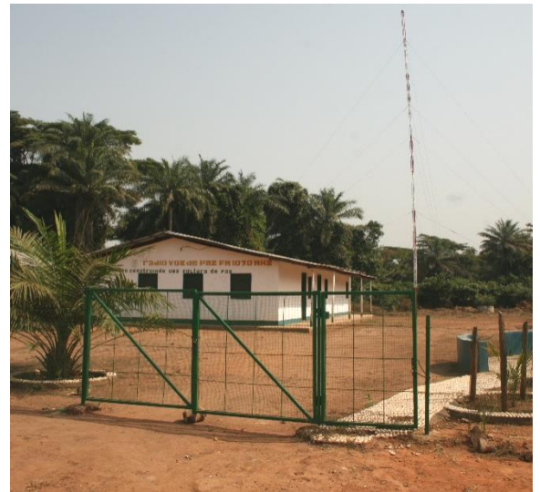
"Christmas tree" with beads in front of Valberto's house The radio station where the solar cells are to be located