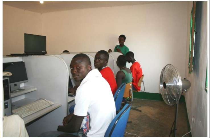
Pupils at their computers in the IT hall