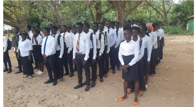
The new school building for year 12 is now ready