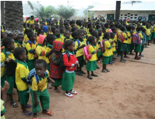
The preschool class welcomes us

THANK YOU for all generous gifts and the schoolfees during 2019-2020! 60 schoolfees have been paid for children who otherwise would not have been able to attend school. Now they can go to a well-functioning school with 790 pupils. In 2019, we donated money to a new school building, which has been used for grade 12. In the be-