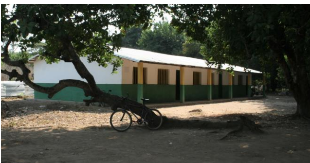
New school building forgrader 12