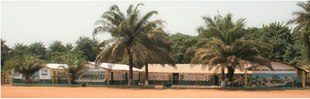
The school in Cacine with the footballground