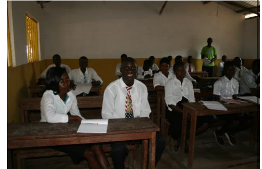
Grade 12 has a lesson